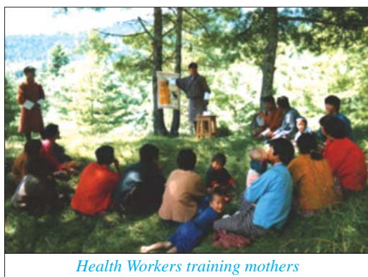
Health Workers training mothers

About 85% of births still take place at home, most often under unhygienic conditions. Poor transport and communication infrastructure hamper referral to health units with essential obstetric services. Trained deliveries in 2002 accounted for about 29% of all births but antenatal attendance at clinics was 39,451 cases, which means there were on average 3.7 antenatal visits per pregnancy 35 .