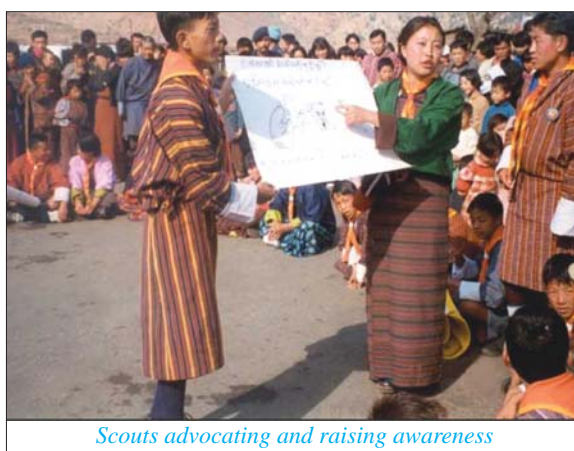
Scouts advocating and raising awareness

The government is committed to adopt appropriate strategies to create gender awareness on women's rights; promote child day-care facilities in urban areas; develop a national policy to provide flexible time for breast-feeding and maternity and paternity leave for employees; promote measures that encourage retention of girls in higher levels of education; improve existing reproductive health services and RH/sexuality education programmes in the school system including attention to the prevention of HIV/AIDS, and any form of sexual harassment and abuse.